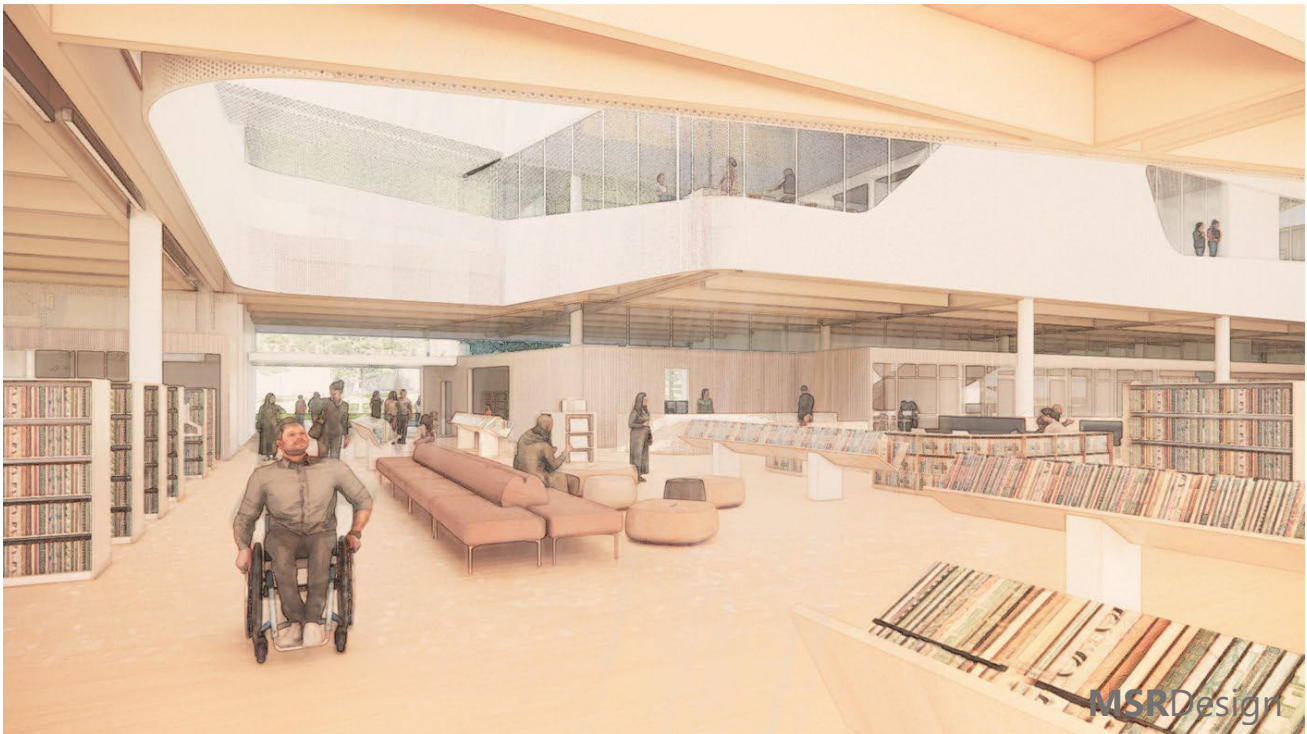
South entry space highlighting the welcoming, accessible, and light-filled library space. This rendering also shows the connection between the first and second floor.