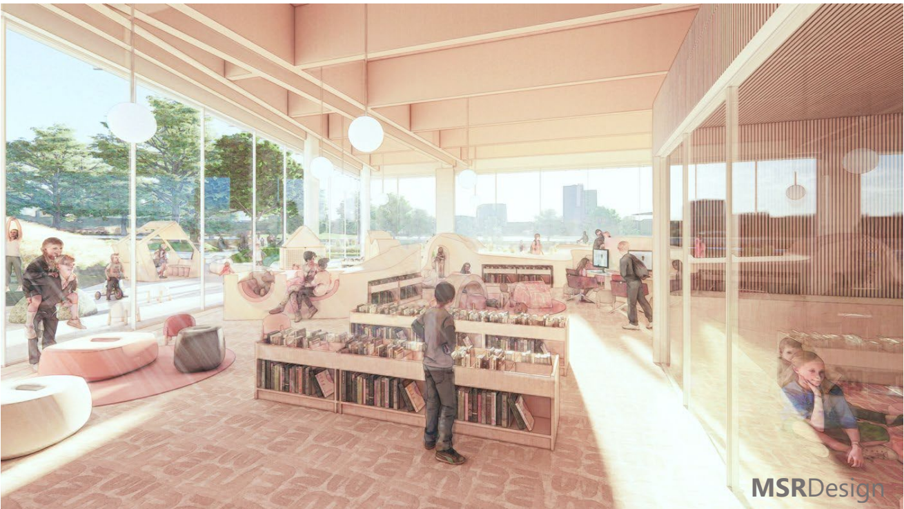
Children's area highlighting space for story time, collection, and connection to the outdoor learning space.