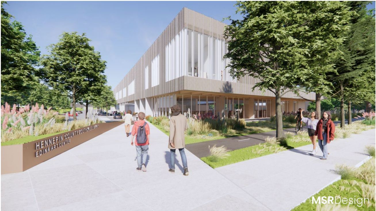
Northwest approach to the building.