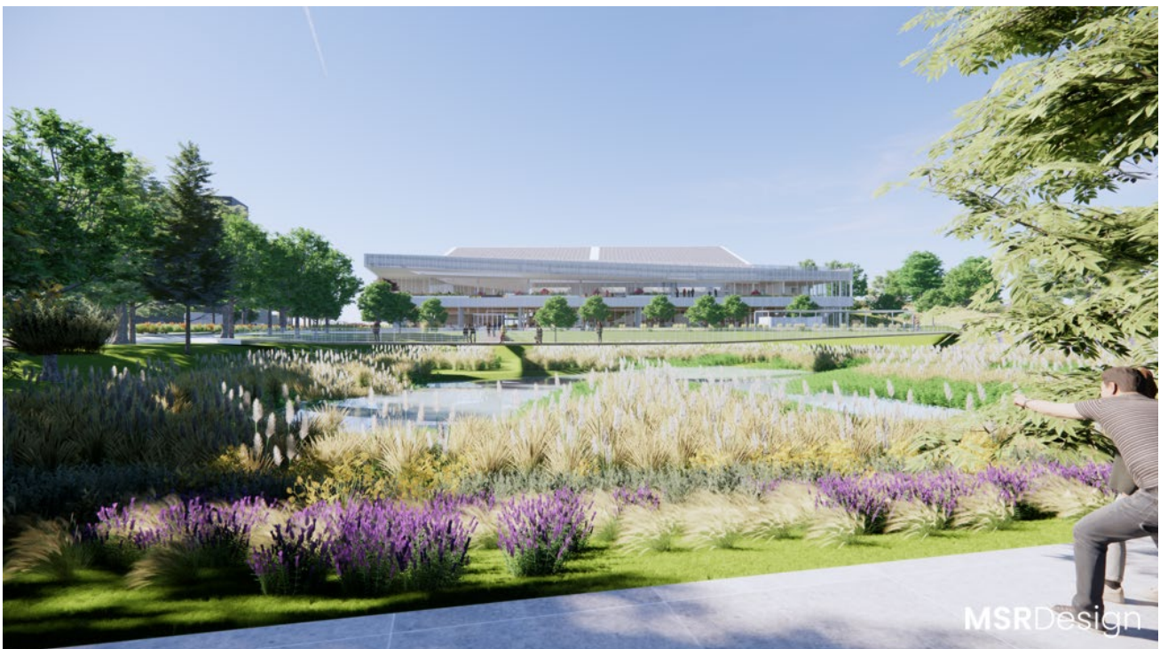
South landscape highlighting native landscape and library building in the distance.