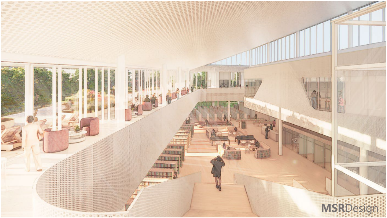
Level 2 highlighting the second-floor library space and outdoor roof terrace.